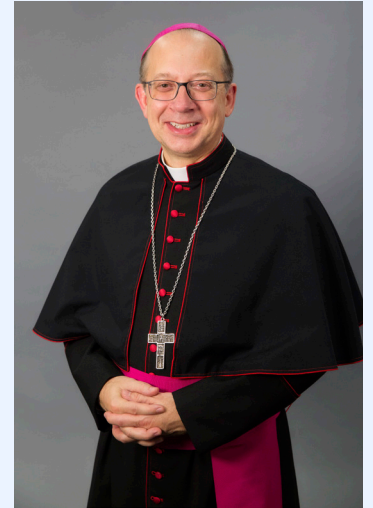
Bishop of Richmond