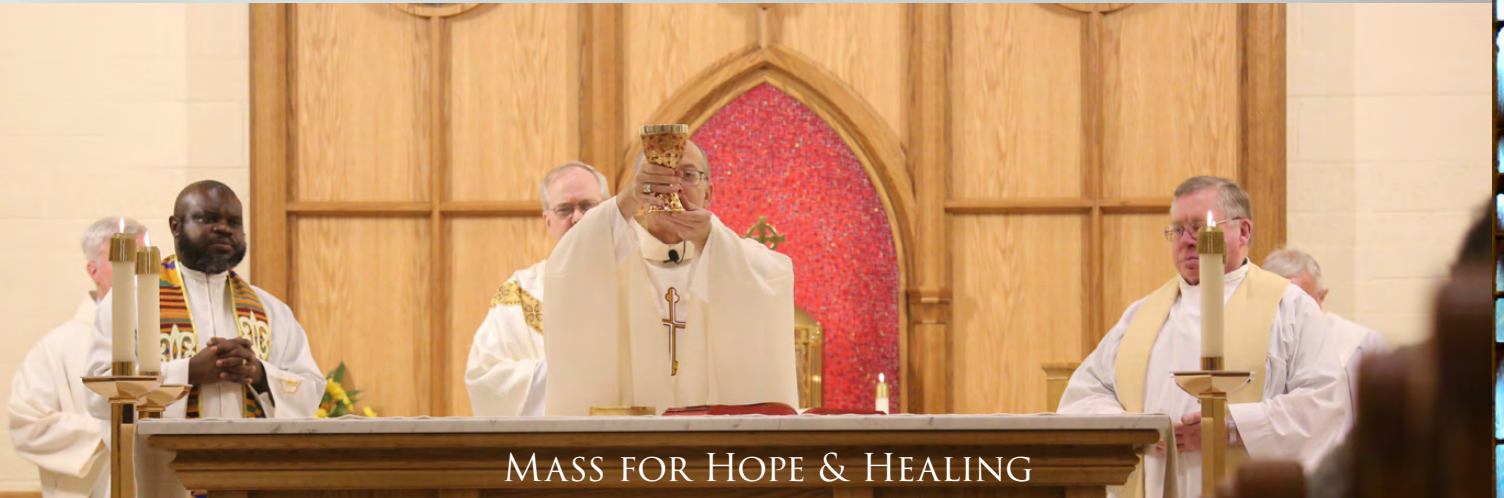
MASS FOR HOPE & HEALING

abuse by clergy. These allegations were of past abuse, however only reported in 2023. Both were determined as being credible. Additional allegations were brought forward against a lay employee. These allegations were investigated by civil authorities.